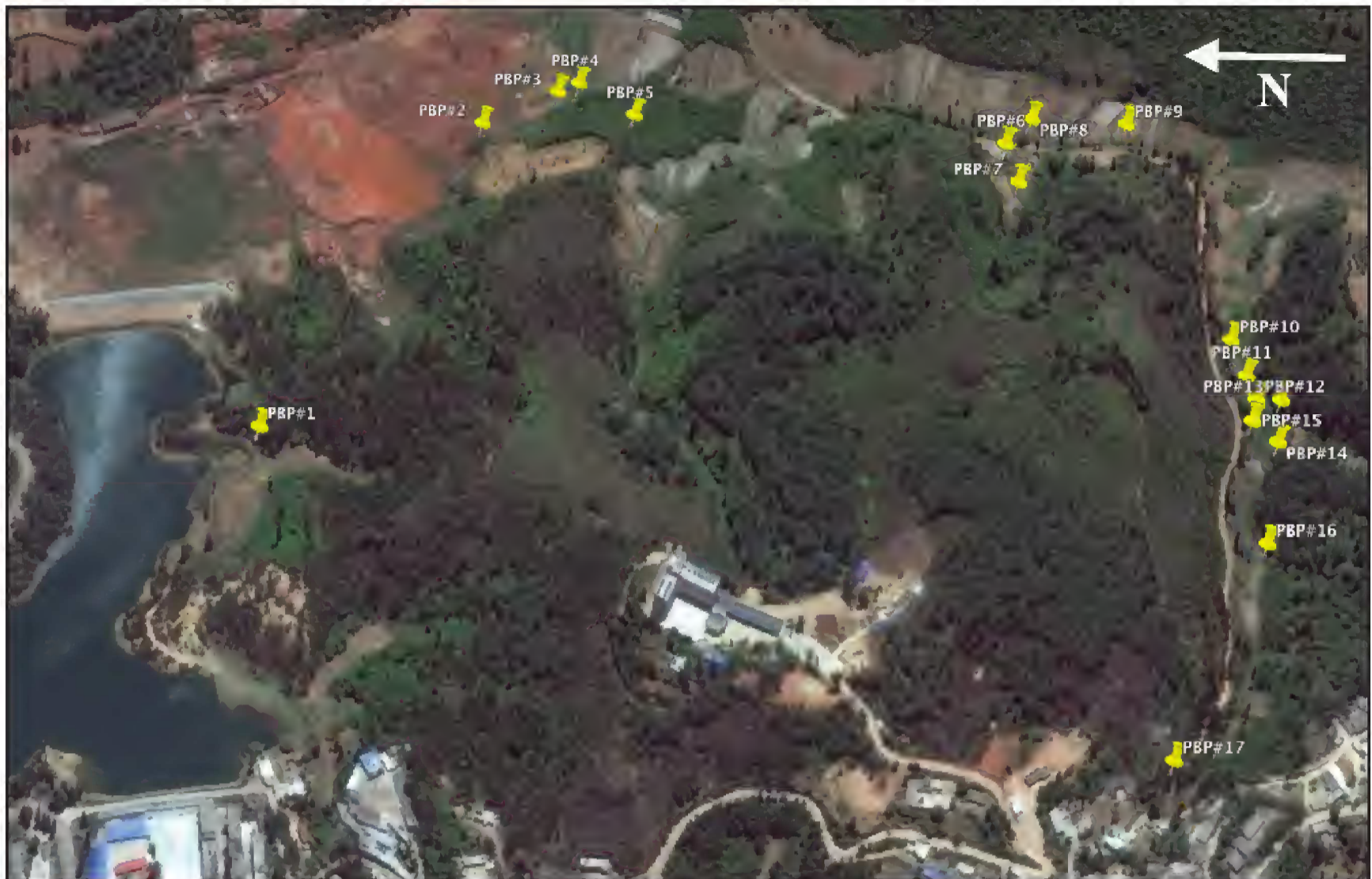
Fig. 1. Location of the study site (the type locality of Tylototriton yangi ) at Gejiu, Honghe Prefecture, Yunnan Province, PR China. Numbered locations of potential breeding pools (abbreviated as PBP) are shown in yellow.

Understanding the reproductive biology of T. yangi in a comparative framework will facilitate future studies to investigate the evolution of reproductive biology of the genus. Furthermore, since the known distribution range of T. yangi overlaps greatly with that of major tin-mining sites in China, it is imperative that we understand its habitat requirements and reproductive biology so that effective conservation efforts can be developed and applied.